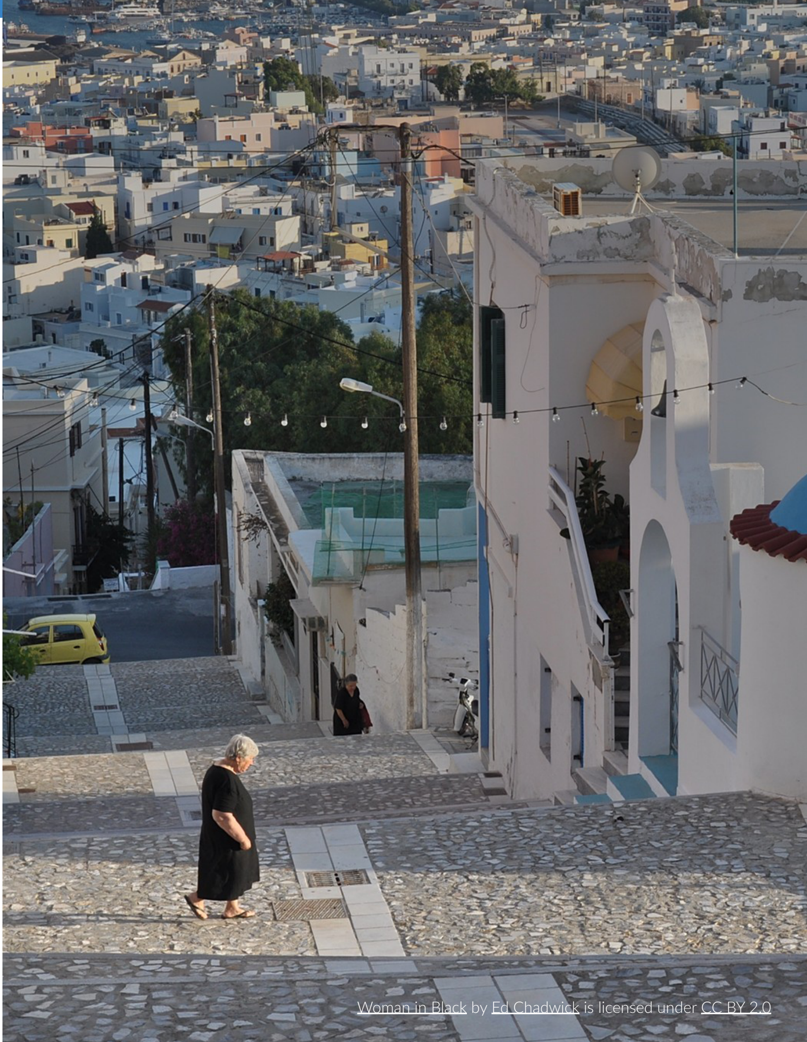
Woman in Black by Ed Chadwick is licensed under CC BY 2.0